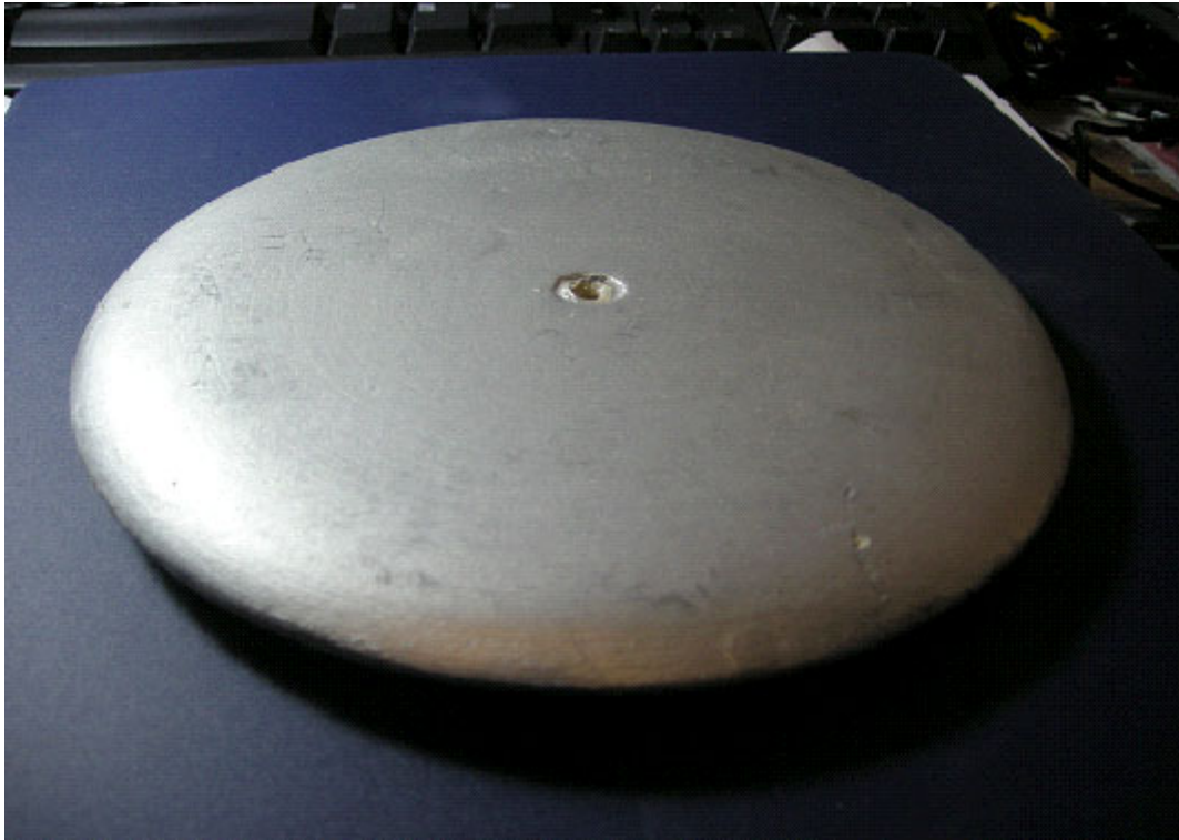
This a photo of a model I made many years ago of the craft that I saw in Aug. 1969